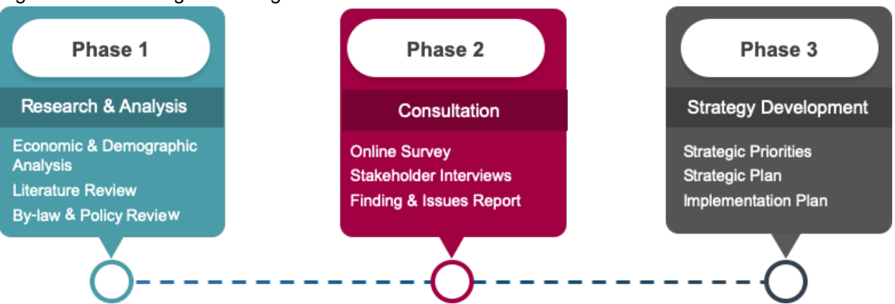
Figure 3: The Strategic Planning Process

The Economic Development Findings and Issues Report completed in October 2020 provided a thorough analysis of economic and demographic trends, literature, by-law and policy review along with a summary of the resident and stakeholder consultation. The Findings and Issues Report identified the issues, opportunities and considerations that framed the discussions of the strategic planning steering committee as they established the economic development strategic priorities. The five strategic priorities identified by the Steering Committee are the foundation of this Strategic Plan.