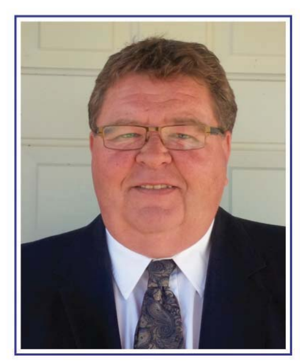
Each Office Is Independently Owned And Operated